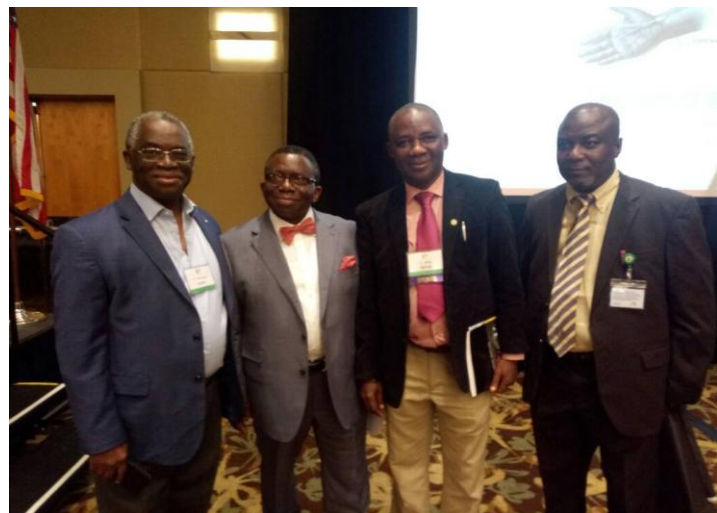
Health Minister, Prof. Issac Adewole, NMA President and Ag. Registrar of the MDCN at the ANPA Conference in the USA.