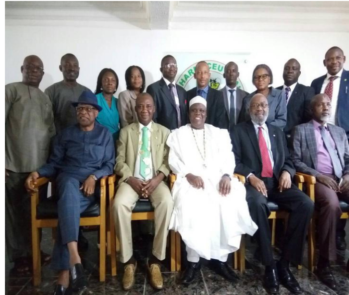
Cross section of NMA and PSN delegation during the working visit of the NMA President to the PSN Headquarters, Abuja.