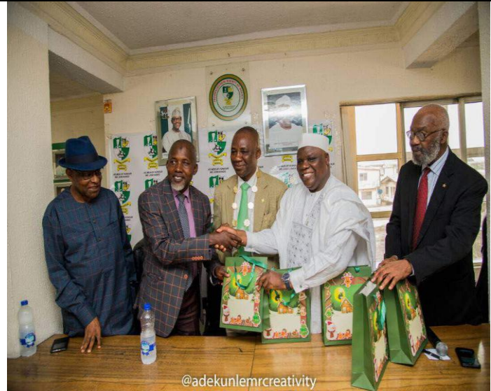
Presentation of souvenir by the PSN President to the NMA President and Secretary during the NMA working visit to the PSN Leadership in Lagos.