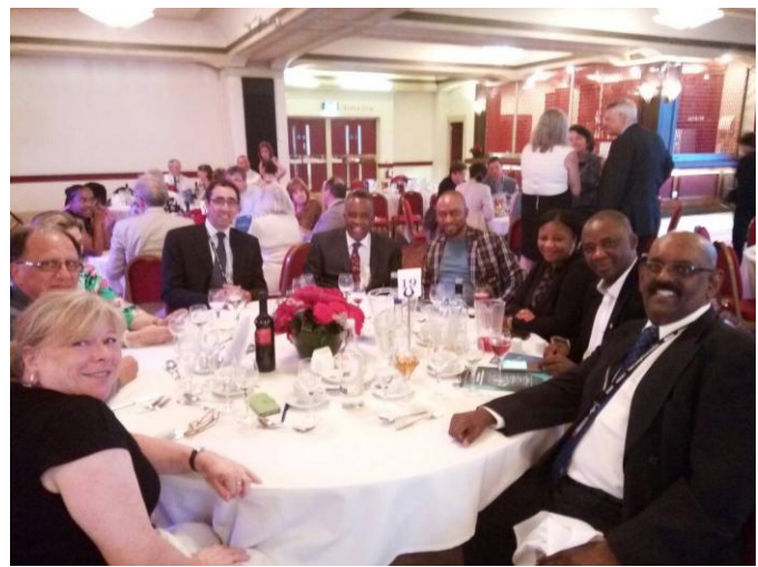
NMA President and DSG with other participants at the just concluded ARM meeting of the BMA.