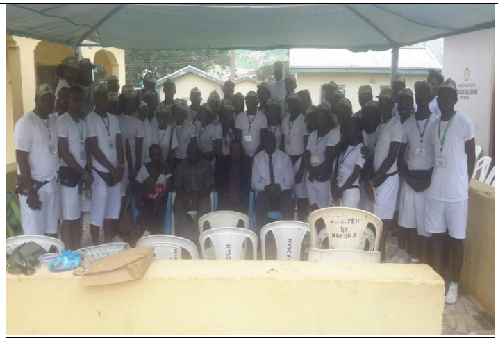
Chairman Committee on NYSC and FCT NMA Execurives on a visit to the NYSC Camp, Abuja.