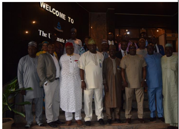
Cross section of NMA delegation and NANNM delegation at the handover ceremony of the interprofessional committee report