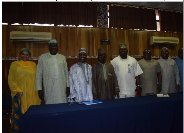
NMA and NANNM leadership at the Joint Committee report handover ceremony.