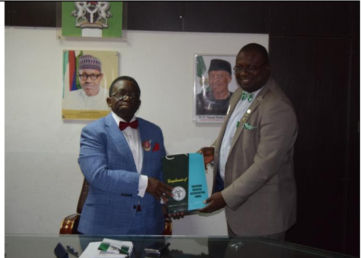
NMA President making a presentation to the Hon. Minister of Health, Prof. Isaac Adewole during a courtesy visit to the Minister.