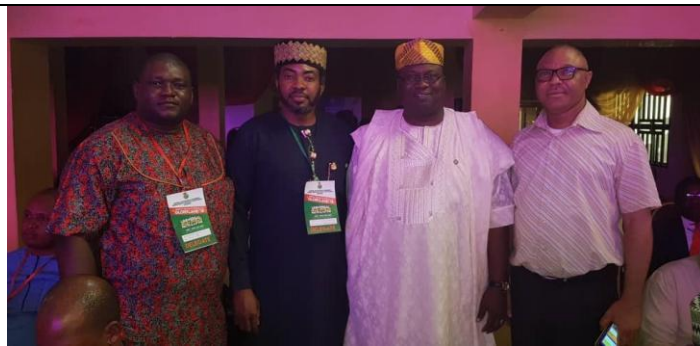
Cross section of NOC members at the cock tail that heralded the 2018 December NEC meeting in Uyo, Akwa Ibom State.