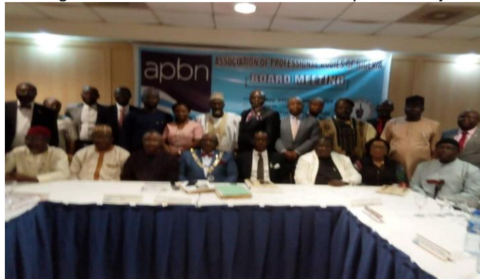
Cross section of Council members after the 1 st meeting of the APBN Board in Abuja.