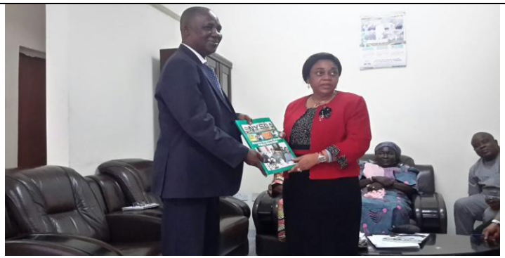
NMA President receiving a souvenir from the Representative of the DG of NYSC.