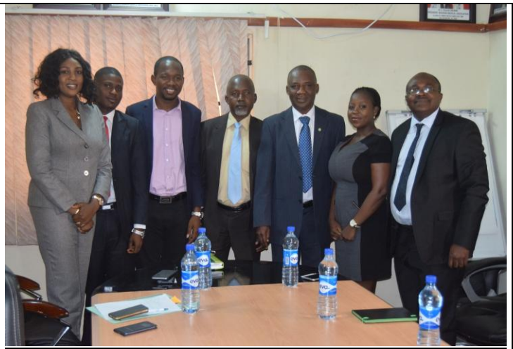
Members of the Management team of Eco Bank Plc on a working visit to the NMA National Secretariat, Abuja.