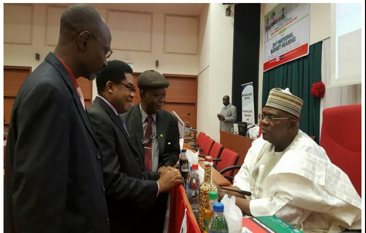
Members of the NMA Legislative committee having a chat with a member of the Joint Senate Committee on the 2017 budget at the National Assembly, Abuja.