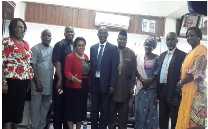
Cross section of NMA Delegation and NYSC management team during the visit to the NYSC Headquarters, Abuja.