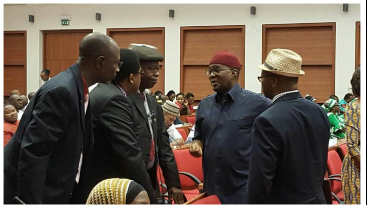
Members of the NMA Legislative committee during the Joint Budget defense at the National Assembly Abuja