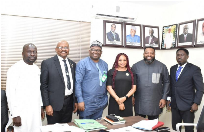
NMA President, Secretary General, DUTUM Company Mgt and NMA Lawyers during an interface held at the Conference Room of the NMA National Secretariat