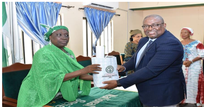
NMA President making a presentation to NCWS President