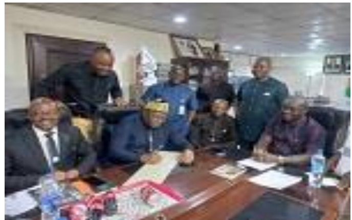
NMA President signing the visitors register during his visit to the CMD of UNTH