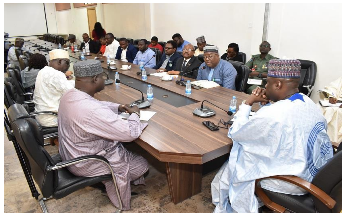
Cross section of members and Defence Ministry Management team during NMA Courtesy visit to Perm-Sec Ministry of Defence.