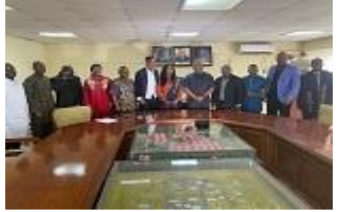
Cross section of delegation during the ARCON Visit