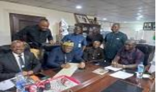
NMA President during the courtesy visit to the CMD, UNTH