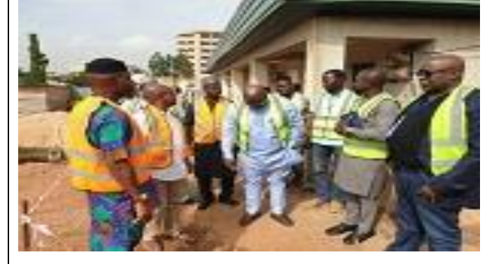
NOC visit to the NMA Land Maitama, Abuja.