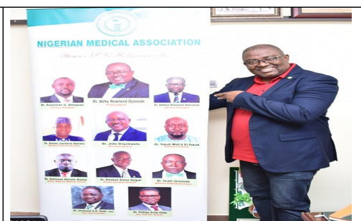
NMA President, posed with the NOC Rollup Banner at his office in Abuja.