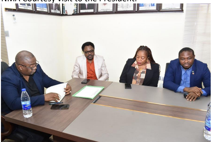
Cross section of NMA FCT delegation during their courtesy visit to the NMA President.