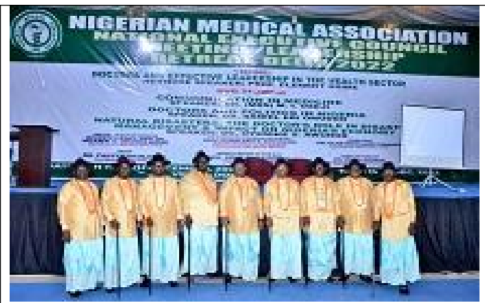
NMA NOC in a group photograph during the Asaba NEC Meeting