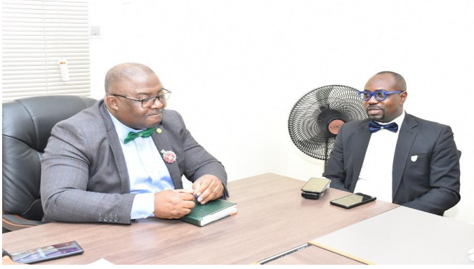
NMA President and the MDCAN President during MDCAN visit to the NMA National Secretariat