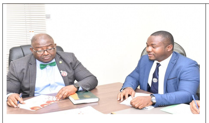
NMA President in a photograph with NDA President