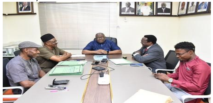
NMA President, Secretary General and Head of Admin having a brief meeting with WESTON Limited- Syndesis Health .