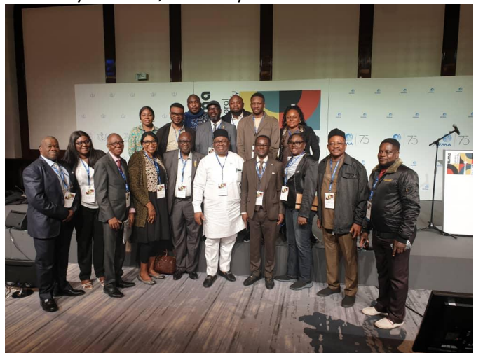
Cross section of Nigerians during the WMA General Assembly in Germany.