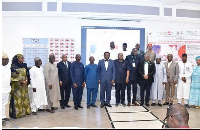
Group Photograph of the Participant at the one Day National Health Symposium organized by NIPSS.