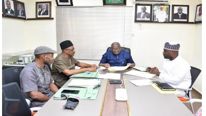
NMA President and Secretary General signing an MOU with GENLAB Integrated Service limited.