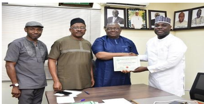
Group Photograph with GENLAB Integrated Service Limited