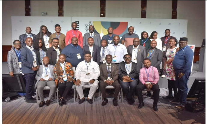
Cross section of participants at the recent WMA General Assembly in Berlin, Germany.