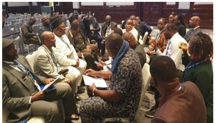
NMA Delegation at Berlin Conference in Germany having a session with other African Countries