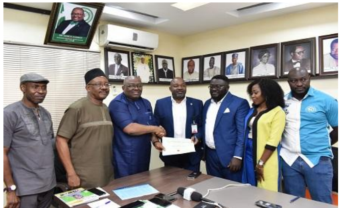
NMA in a group Photograph with Integrated Dairies limited.