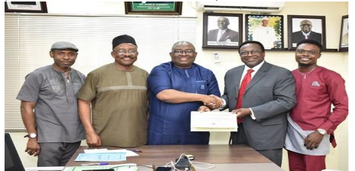
Group photograph of NMA representatives and WESTON Limited- Syndesis Health.